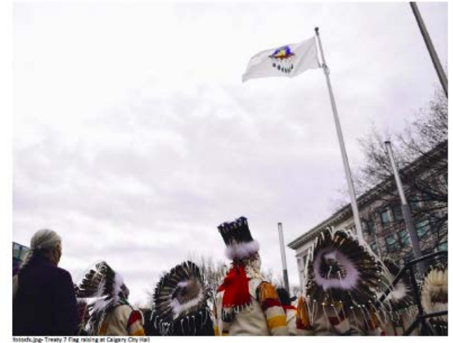
Engaging with Elders: A Co-created Story